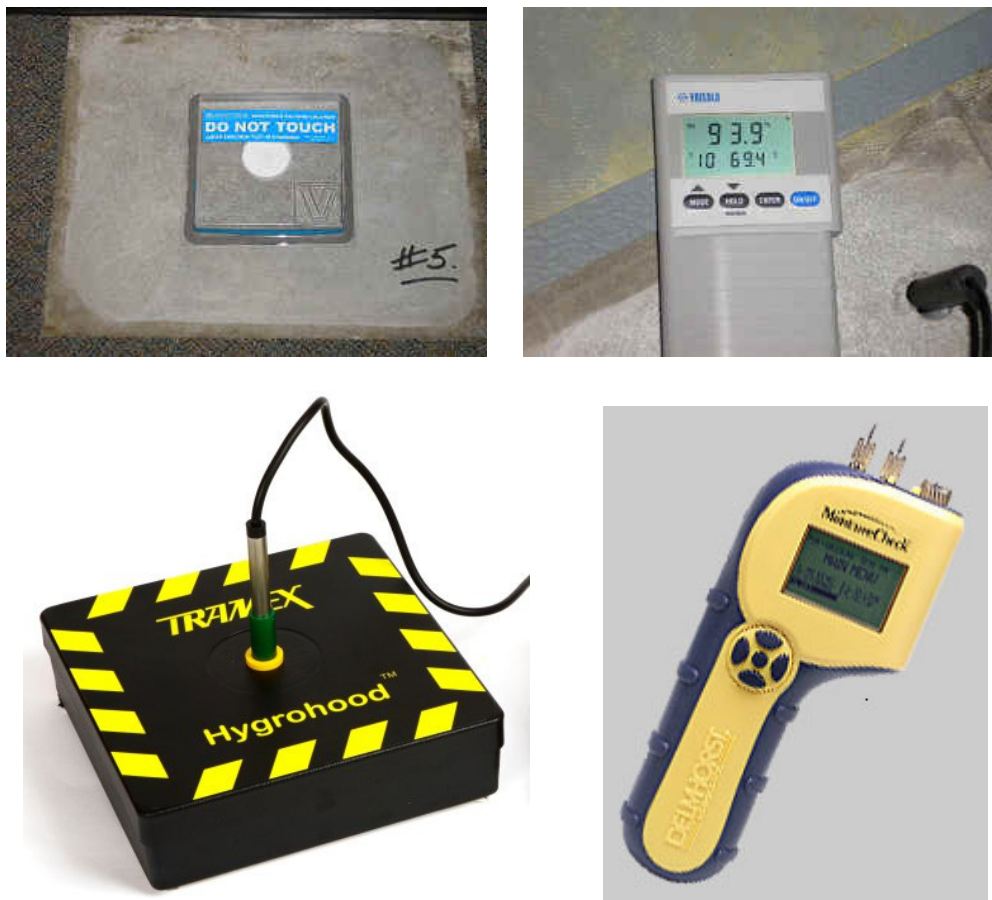
Figure 1.1 – (Clockwise from top left) ASTM F1869 Calcium Chloride Test Kit, ASTM F2170 Relative Humidity Meter, ASTM F2420 Insulated Hood with probe attached, and ASTM F2170 Pin Type Moisture Meter

ASTM F1869, ASTM F2170 and ASTM F2420 are quantitative tests (stating approximately how much moisture is present) while ASTM D4263 is a qualitative test (stating that moisture is present but not how much), and all are a “snapshot” of moisture vapor emission during the testing period.