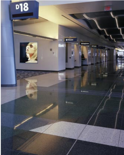
Completed work at main terminal.

Bottema used the thick bed method, a 2.5 inch deep bed of LATICRETE 3701 Mortar Admix with LATICRETE 226 Thick Bed Mortar. "It took about 15,000 bags of 226," he said.