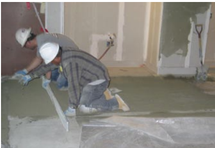
Floor preparation screeding and thick-bed.