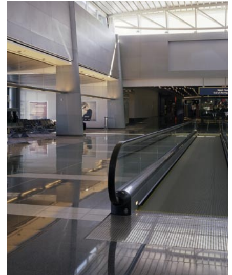
Finished terminal shot.

The excellence of the LATICRETE system also helped the airport lighten up about the job. “I’ve known LATICRETE for many years,” Bottema said. “I knew their products were top notch and we wouldn’t have any problems. They met my expectations and LATICRETE always stands behind the product being installed.”