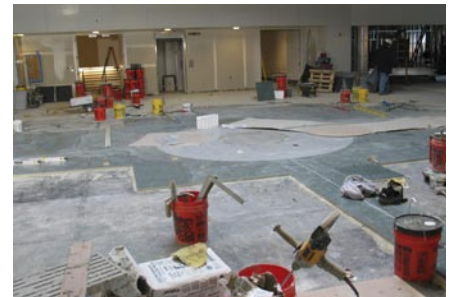
Floor installation in progress.