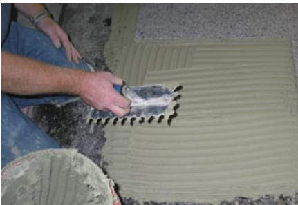
Troweling adhesive mortar.