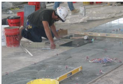
Setting stone pieces in terminal.