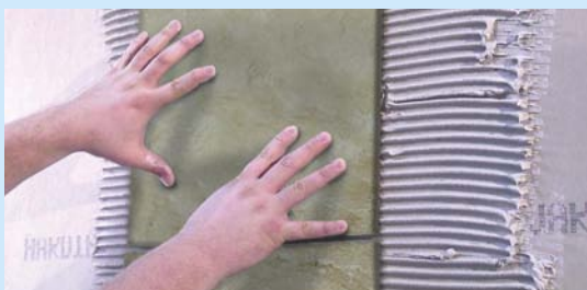
Exclusive Kevlar® component provides non-sag performance even on large format stone.

LATICRETE® Stone Solutions products are designed to increase your productivity, provide for an easier installation and increase your profits. LATICRETE 255 MultiMax Multipurpose Thin-Set Mortar combines 3 mortars in one. It can be used for thin-bed, medium-bed and vertical installations.