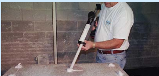
Quickly and easily adjust stones, LATAPOXY 310 will not shrink or move — set it and forget it!