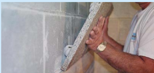
Strong permanent durable bond will not deteriorate over time and is shock resistant.

Take on that next stone cladding job without the headaches associated with complicated traditional labor intensive methods like thin-set, plaster and wire or mechanical anchors. You can triple your productivity, reduce labor costs and work easier with LATAPOXY 310. It is building code approved for cladding applications by the ICC and backed by a 10 Year System Warranty*. LATAPOXY 310 Stone Adhesive has been used around the world on both interior and exterior cladding projects.