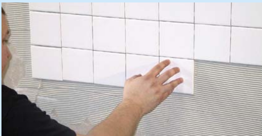
Ideal for small wall tile, provides adjustability, non-sag performance and resists mold and mildew.

A component of the 10 Year Systems Warranty* MultiMax is equipped with Microban®, is certified by GREENGUARD™ for low VOC's and is rated ASTM C627 "Extra Heavy" by the TCA for commercial installations.