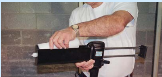
Exclusive cordless mixer applies the desired amount of LATAPOXY® 310 Stone Adhesive without any hand mixing — just squeeze the trigger!

LATAPOXY® 310 Stone Adhesive and the Cordless Mixer provide unmatched speed for permanent interior or exterior vertical stone installations. Install 300-500 ft² per day of stone with ease and accuracy. No cutting kerfs, drilling or mechanical clipping needed.